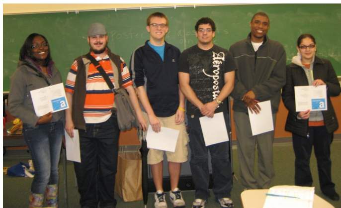
Right to Left