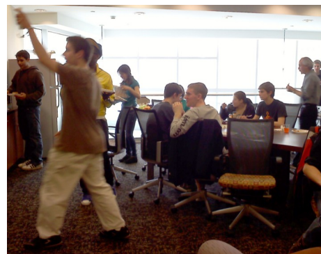
End of spring semester Potluck